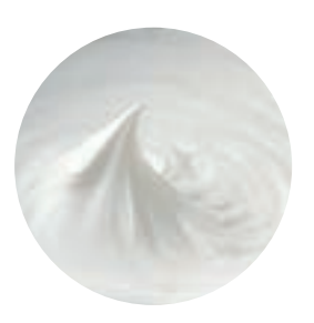
Emulsified & Fermented Ingredients